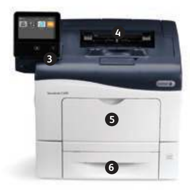
Xerox® VersaLink® C400 Colour Printer Print.